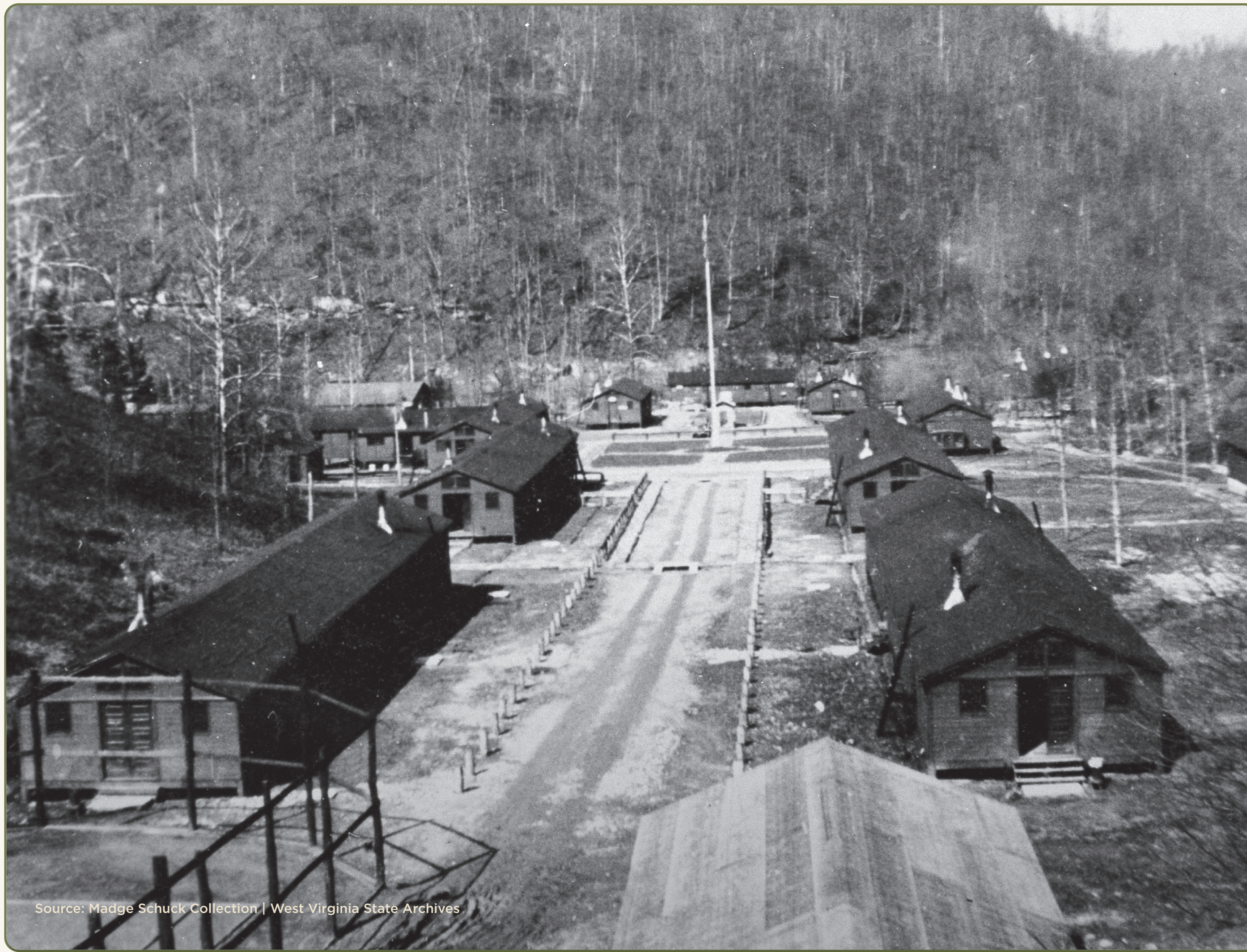
Grounds and Barracks, CCC Camp 2599, S-76, Kanawha State Forest