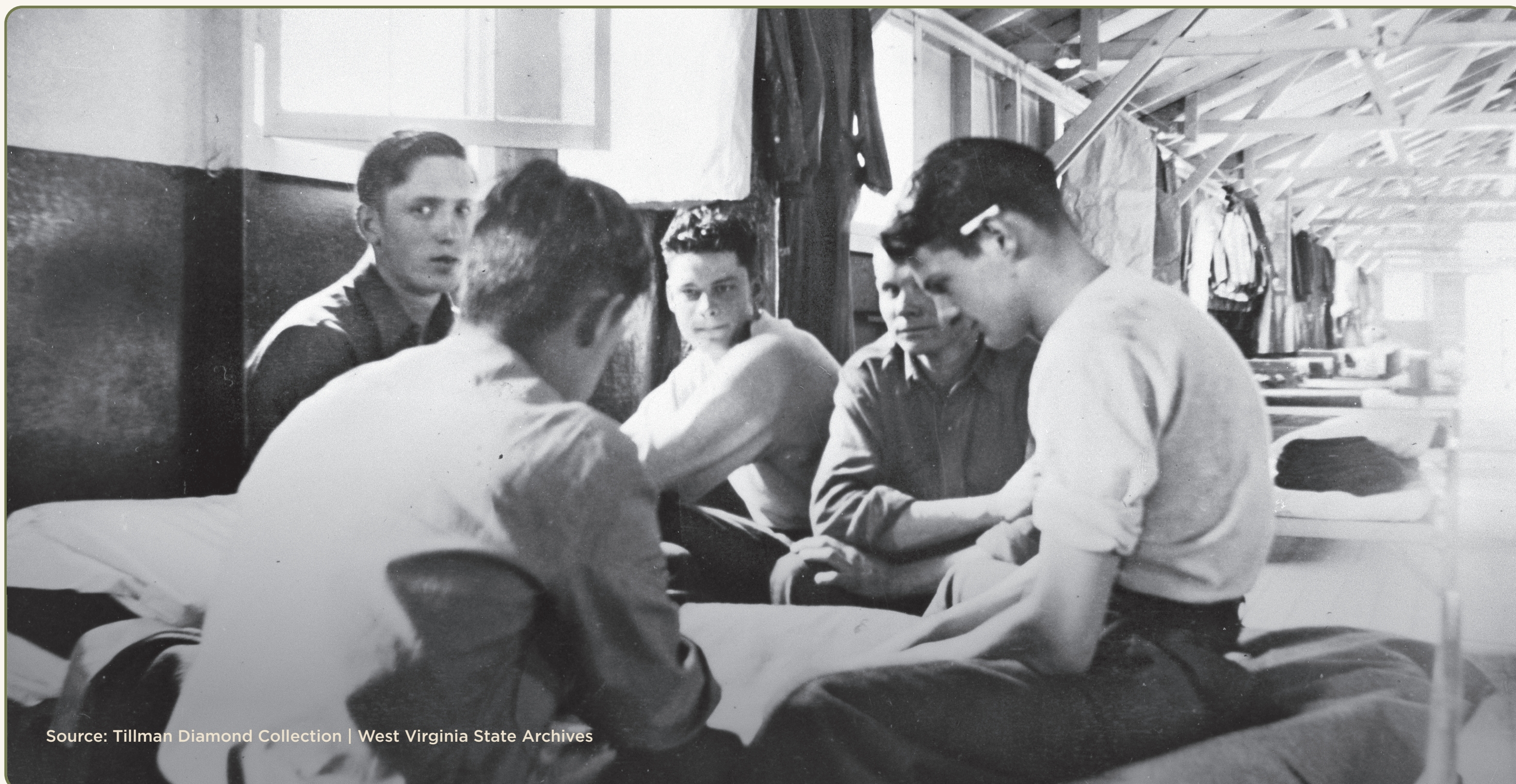
Barracks, CCC Camp 2599, S-76, Kanawha State Forest